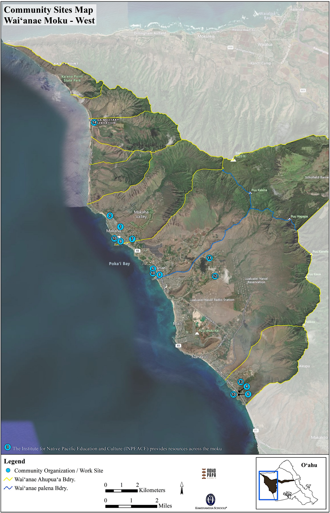
Figure 79. Aerial image with the general locations of the community hui work sites and/or office sites.