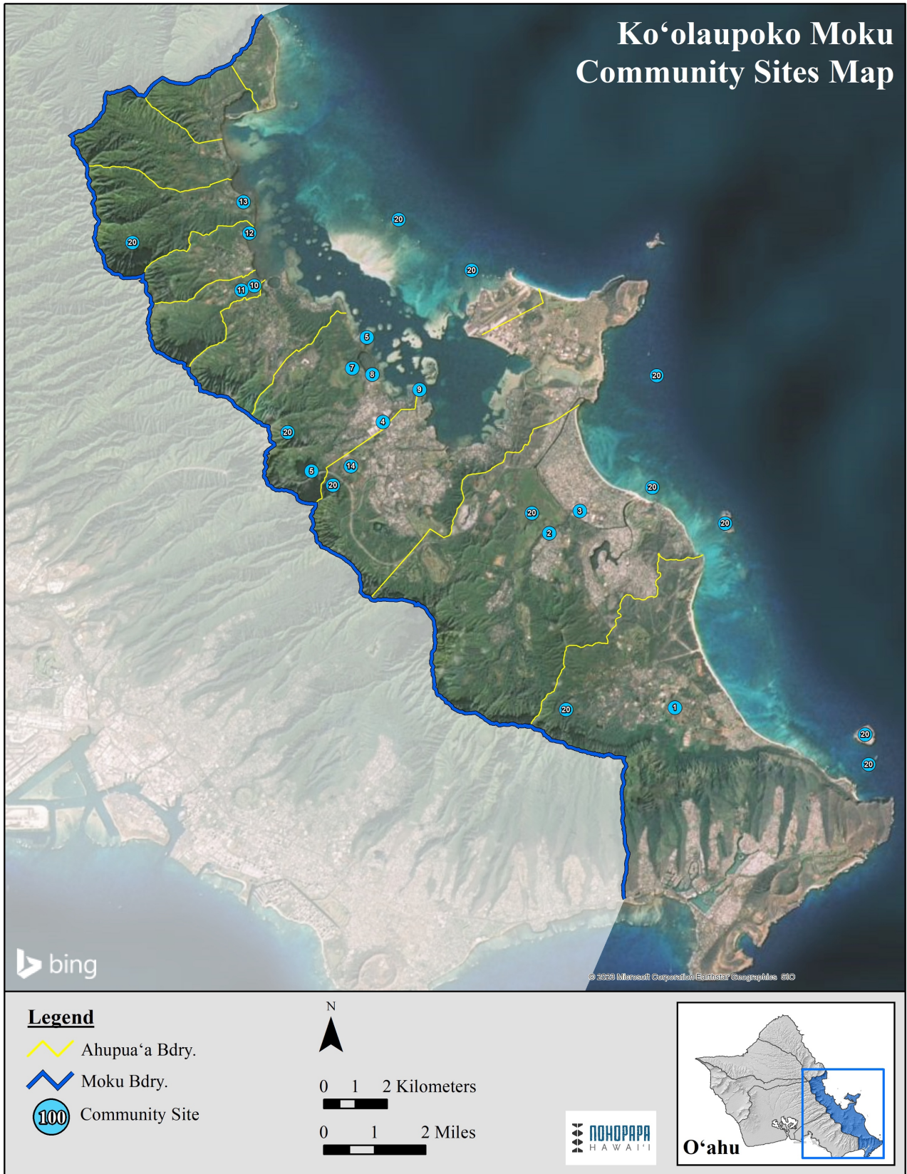
Figure 107. Aerial image with general locations of Ko'olaupoko community hui work sites and/or office locations.